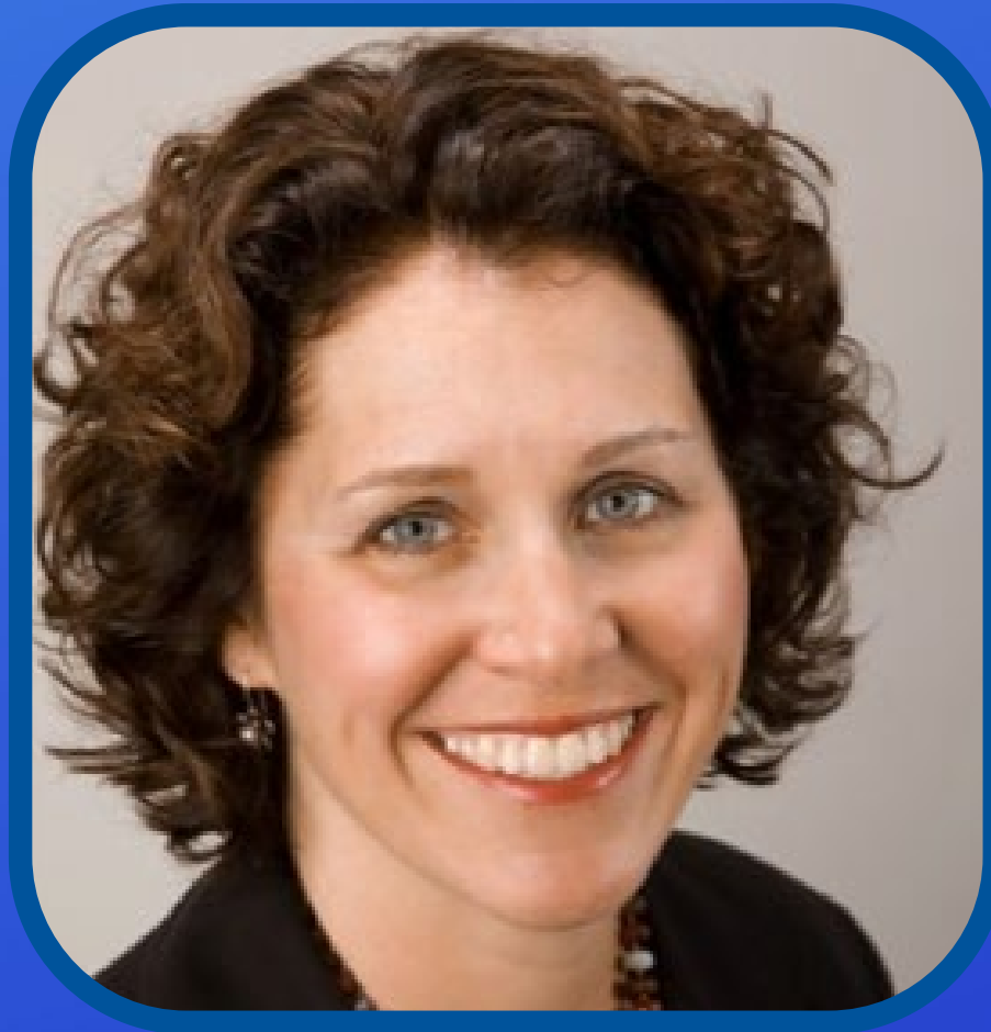
HON. WILLIAM MATTHEWMAN

United States Magistrate Judge Southern District of Florida